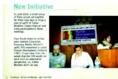
Attached to an Indian Muslim NGO Human Development Initiative. Addressing its first conference in Delhi