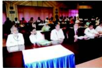
Attending a Conference in New Delhi on Inter Civilizational Dialogue in a Globalizing World.

ATTENDED FOUR CONFERENCES OF US BASED ORGANIZATION ASIA FOUNDATION WORKING FOR WOMEN, HELD IN NEPAL, SRI LANKA, MALYSIA, INDONESIA AND DELHI AS RESOURCE PERSON.