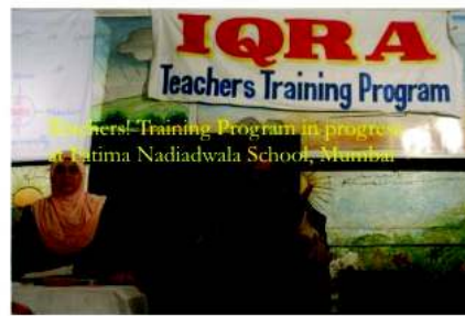
Teachers! Training Program in progress Fatima Nadiadwala School, Mumbai