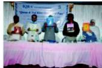
IQRA's Hindi curriculum was released in IQRA's Inter-faith program in 2006

IQRA curriculum was translated into Urdu languages like Urdu, which is introduced in hundreds of schools all over the country. In the year 2006 we published Hindi version of the curriculum, which was released in IQRA's inter-faith program