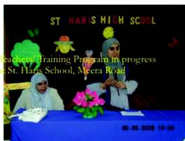
Teachers! Training Program in progress St. Haris School, Meer Road