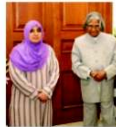
Visited Rashtrapati Bhawan and met President of India, Mr. A. P. J. Abdul Kalam and presented IQRAs books to him for review. He appreciated the efforts of Iqra! in promoting communal harmony.