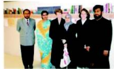
Visited USA under their International Visitors! Program for Religious Educators.

VISITED USA ON INVITATION FROM THE US GOVERNMENT UNDER THEIR INTERNATIONAL Visitor's PROGRAMS FOR RELIGIOUS EDUCATORS. PARTICIPATED IN LECTURES SYMPOSIA AT BERKLEY OXFORD UNIVERSITY, BOSTON AND GEORGE TOWN UNIVERSITIES. DELIVERED LECTURE IN ISNA CONFERENCE IN CHICAGO IN 2003.